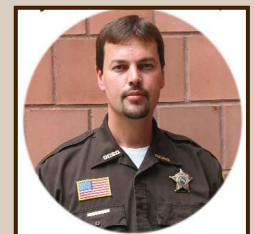
"GOOD TIMES SERVED" ARTWORK BY DAKOTA COUNTY CORRECTIONAL DEPUTY JOE ENGESSE