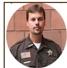
"GOOD TIMES SERVED" ARTWORK BY DAKOTA COUNTY CORRECTIONAL DEPUTY JOE ENGESSER