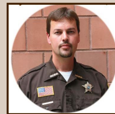
"GOOD TIMES SERVED" ARTWORK BY DAKOTA COUNTY CORRECTIONAL DEPUTY JOE ENGESSER