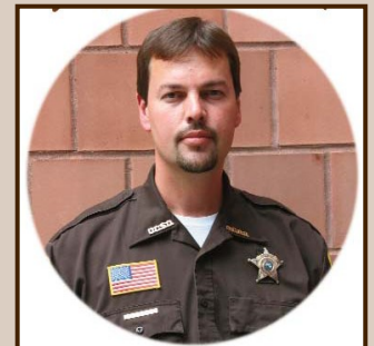
"GOOD TIMES SERVED" ARTWORK BY DAKOTA COUNTY CORRECTIONAL DEPUTY JOE ENGESSER