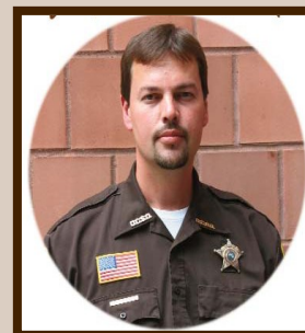
"GOOD TIMES SERVED" ARTWORK BY DAKOTA COUNTY COR- RECTIONAL DEPUTY JOE ENGESSER